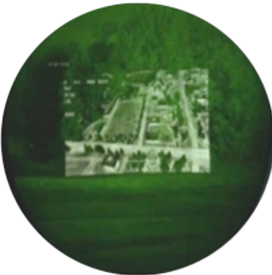
Night Vision with i-Aware Live Video Overlay