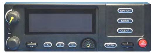
Figure 1: System (top) and Scan (bottom) Front Panels