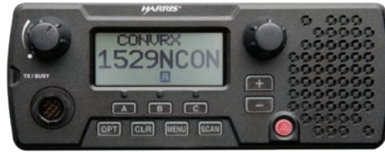
CH-25 Control Unit

The XG-25M comes standard with a CH-25 front-mount control unit. A conversion kit is available for remote mounting. The control unit is a Scan (limited keypad) model with a 4-line, 12-character alphanumeric display. The unit supports P25, 800 MHz EDACS and ProVoice, and OpenSky trunking operation.