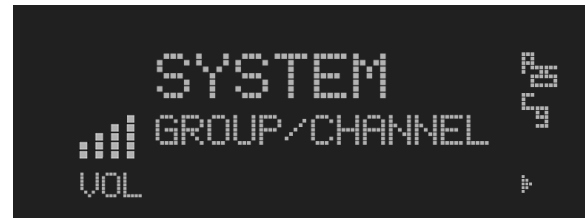
Figure 2: XG-75M/M7300 Series Mobile Radio Display